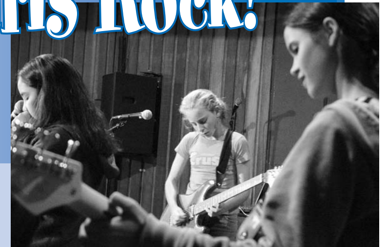
Peach Fuzz in action