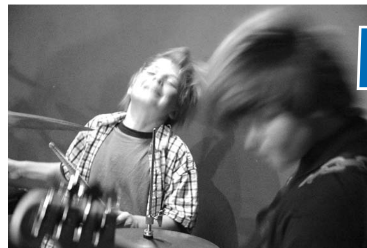
Know Clue: the heart of Rock and Roll.

For all time, 2005 will be remembered as the year that youth bands first lit up Blue Bear's halls and rocked the block. From after school bands to our five week-long Summer Camps, the school's programs for young people have really expanded.